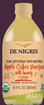
WITH HONEY & GINGER ARTDENIUS0B023