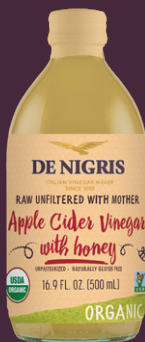
WITH HONEY ARTDENIUS0B011