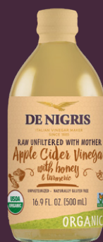
WITH HONEY & TURMERIC ARTDENIUS0B022