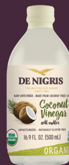
WITH MOTHER ARTDENIUS0B027 16.9 FL OZ