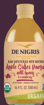
WITH HONEY & CRANBERRY ARTDENIUS0B024