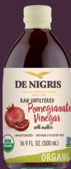
WITH MOTHER ARTDENIUS0B025 16.9 FL OZ